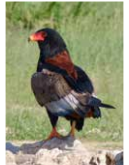
Bateleur

SEE DETAILS AND REGISTER AT TUCSONAUDUBON.ORG/EXCURSIONS