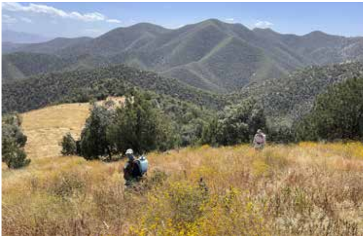
Mansfield Canyon, Tony Figueroa

Tucson Audubon's In-house Strike Team successfully completed an invasive plant treatment project in Mansfield Canyon of the Santa Rita Mountains in collaboration with Borderlands Restoration and the Coronado National Forest. Despite the amazing amount of rain this summer, the crew was able to treat invasives on about 30 acres at four disturbed hard rock mining sites and 8 miles of roadside with minimal damage to non-target plants. The list of invasives includes Bermuda grass, Lehmann's, weeping, and African lovegrass, stink grass, crab grass, yellow bluestem, natal grass, barnyard grass, Johnson grass and Russian thistle (tumbleweed). Coronado National Forest staff was very impressed—Congratulations!