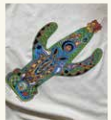
Earth Art Cactus Tee $28.00