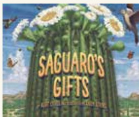
Saguaro's Gifts by Kurt Cyrus $16.99