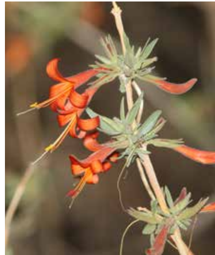
Lazuli Bunting, Monarch butterfly, Desert honeysuckle

“The Violet-crowned is over on Feeder 4.” “OOH, there’s a tanager above the suet on the pecan tree!”