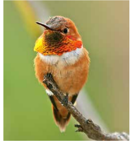
Canyon morning glory; Trans Pecos morning glory, Viridiana Orna; Rufous Hummingbird, Alan Schmierer

Southeast Arizona has an amazing diversity of 15 hummingbird species, which makes it one of the best places in the US to see these tiny, colorful birds. Local hummingbird species include Anna's, Broad-billed, Black-chinned, and Rufous—we are very fortunate that a few of these hummingbirds can be seen year-round here.