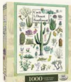
Cacti of the Desert Southwest 1000pc Puzzle $20.00