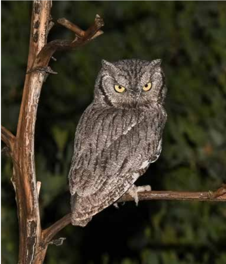
Western Screech-Owl, Dan Weisz; BELOW: Screech-owl nestbox installations at various sites