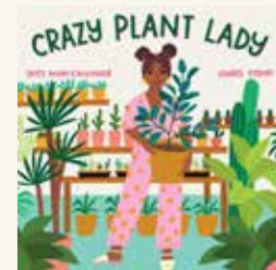
Crazy Plant Lady 2022 Mini Wall Calendar $7.99