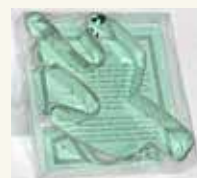
Saguaro Cookie Cutter $7.95