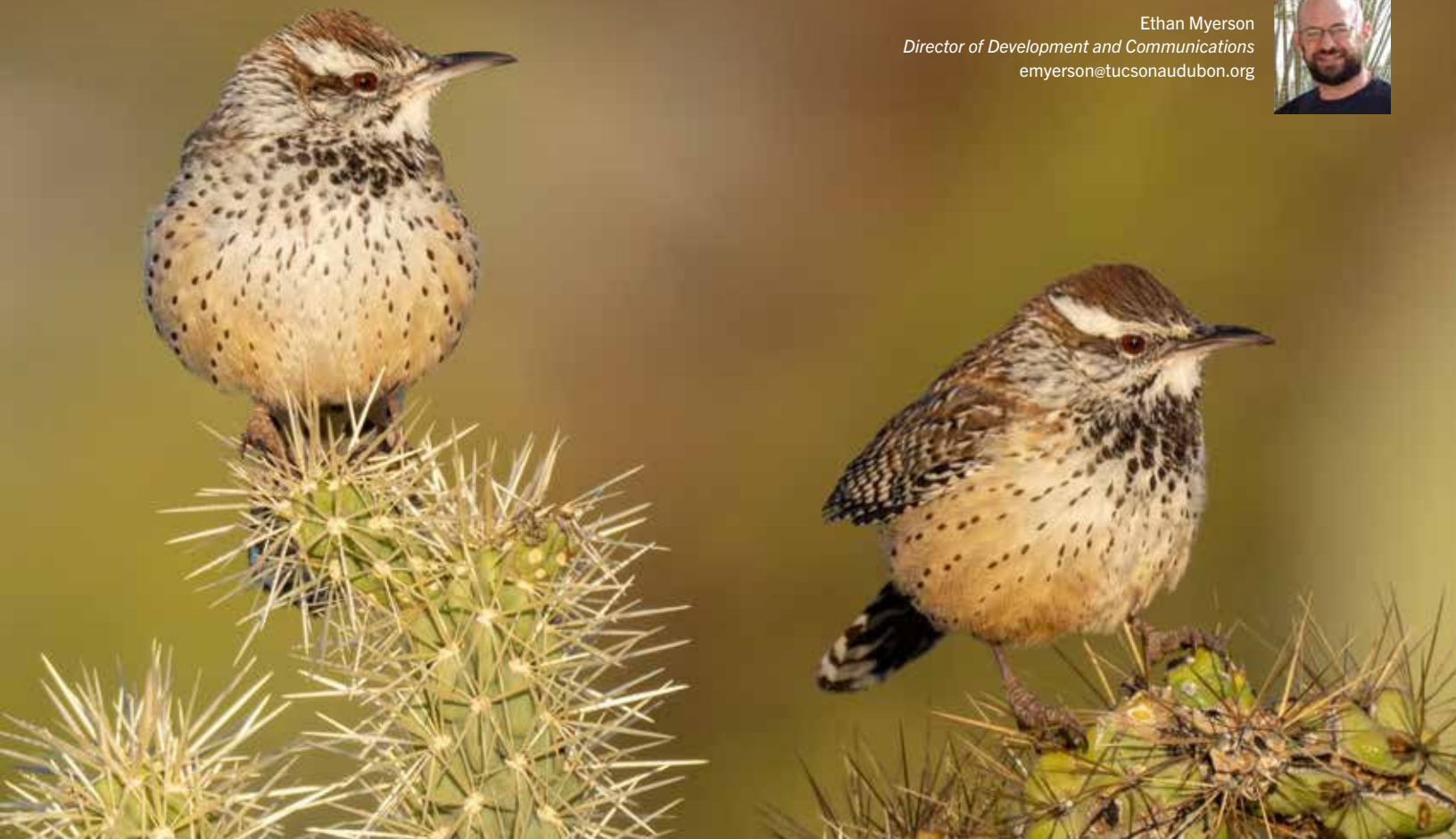
Cactus Wrens