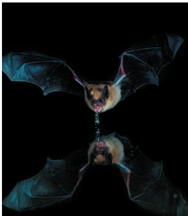
Long-eared myotis bat