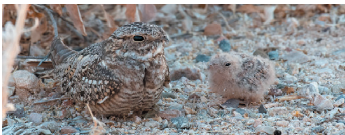
Lesser Nighthawk with chick