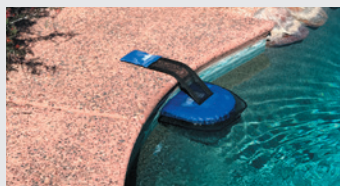
Escape ramp in swimming pool