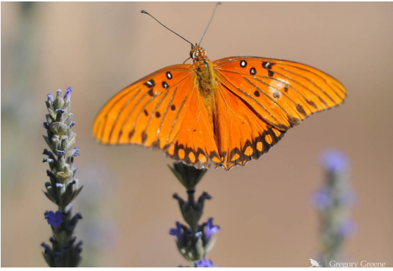
GULF FRITILLARY ( Agraulis vanillae incarnata )