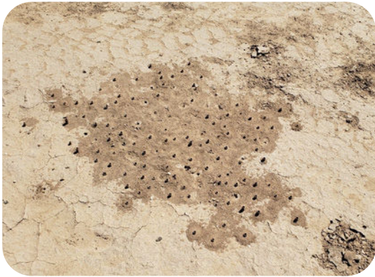
Ground-nesting bee nests, Jennie MacFarland

Try your best not to disturb the ground near nests and by maintaining patches of bare ground. In your garden, don't cover all bare ground with bark chips or mulch, especially in sunny areas and south-facing slopes.