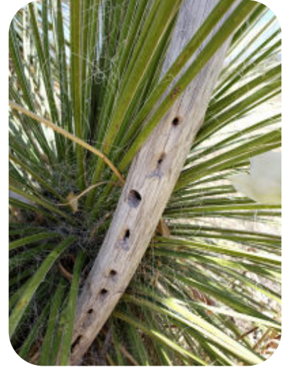
Agave stalk used by cavity-nesting bees, Jennie MacFarland

Cavity-nesting bees prefer standing snags and dead wood. To protect these natural nesting sites, leave them as long as they don't pose a threat to people or structures.