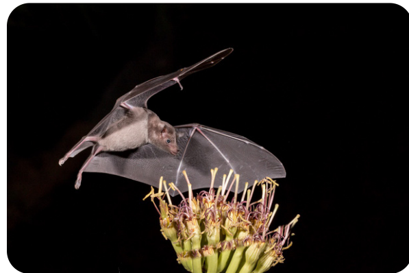
lesser long-nosed bat feeding on agave flowers, James Capó